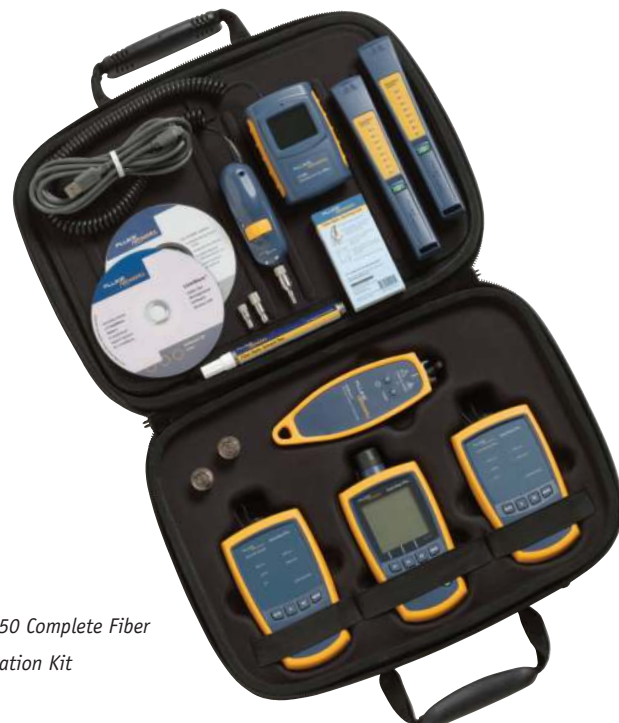
FKT1450 Complete Fiber Verification Kit